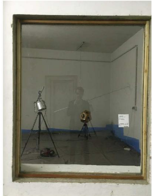
Figure A.2.2: tested glazing (receiver test side)